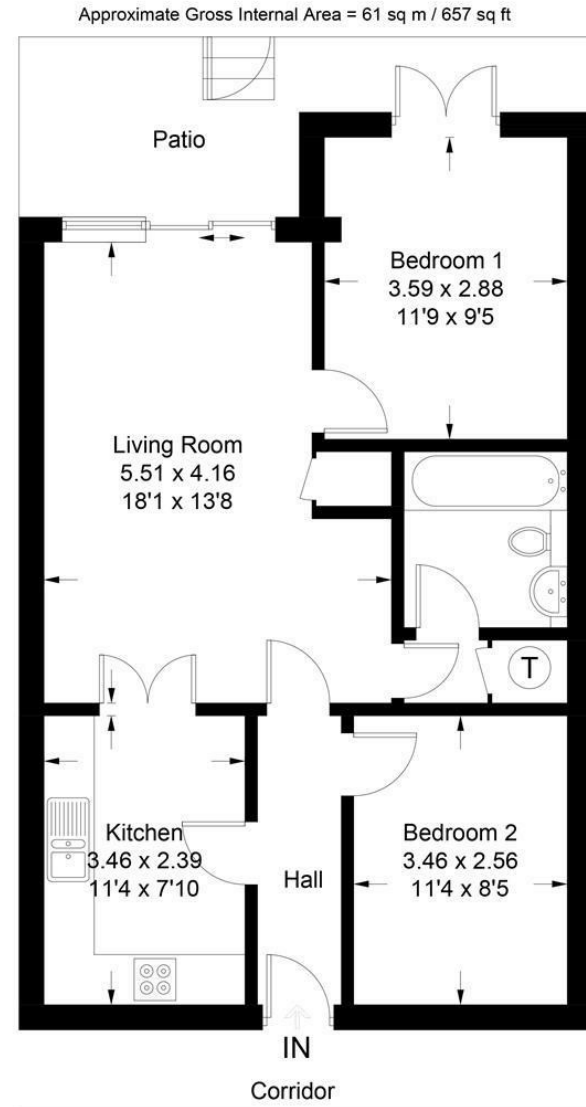
Illustration for identification purposes only, measurements are approximate, not to scale. floorplansUsketch.com © (ID747457)